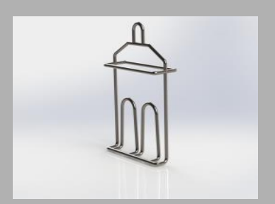
Hook - Goose, duck

The heights of the beams can be set separately during operation; the width of the machine can also be set with the threaded spindles located on either end. These are also used to open the machine for cleaning or rubber replacement.